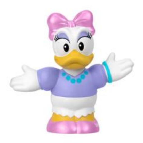
Recalled Daisy Duck Figure